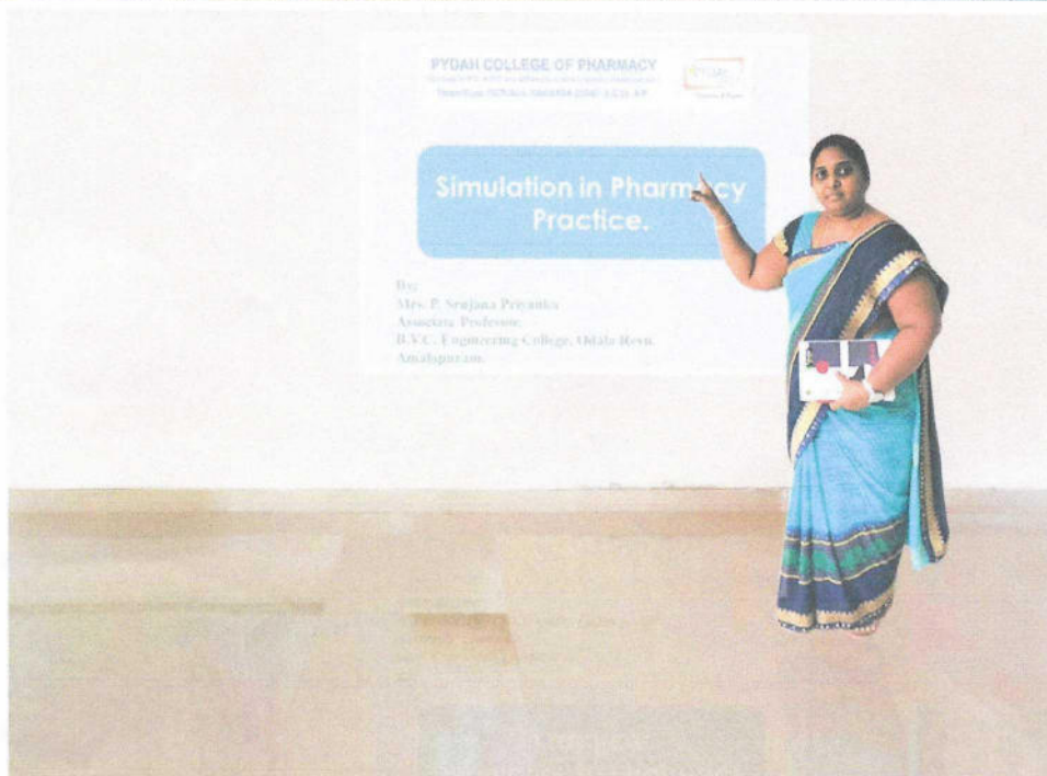
Expert's Presentation to students

A handwritten signature in black ink, consisting of stylized, overlapping letters.