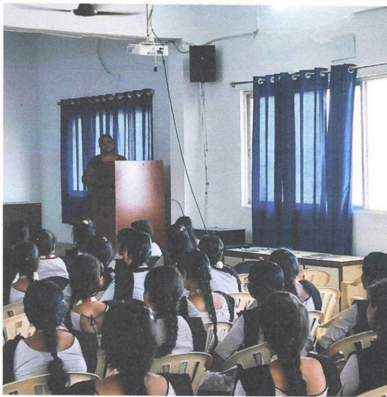
Expert explain to students