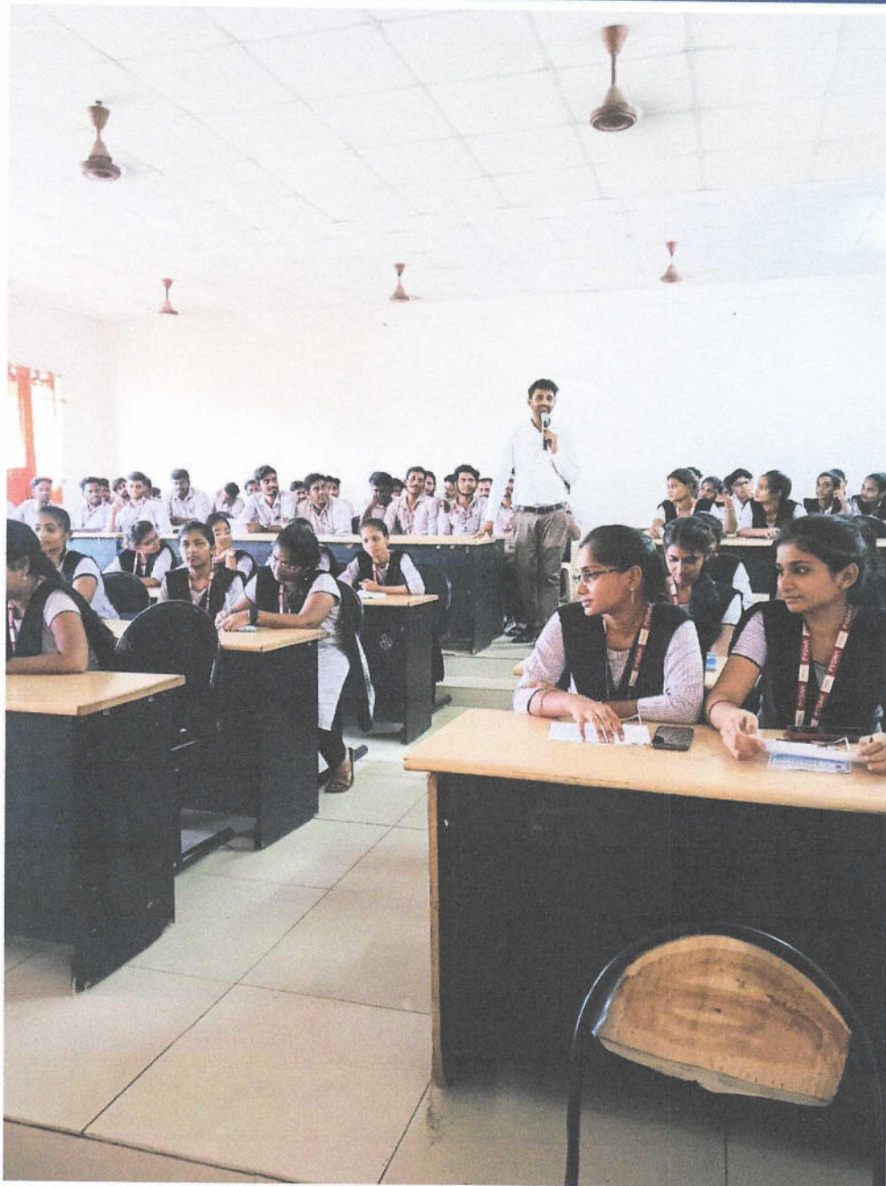
Expert Talk about Computer Applications in pharmacy