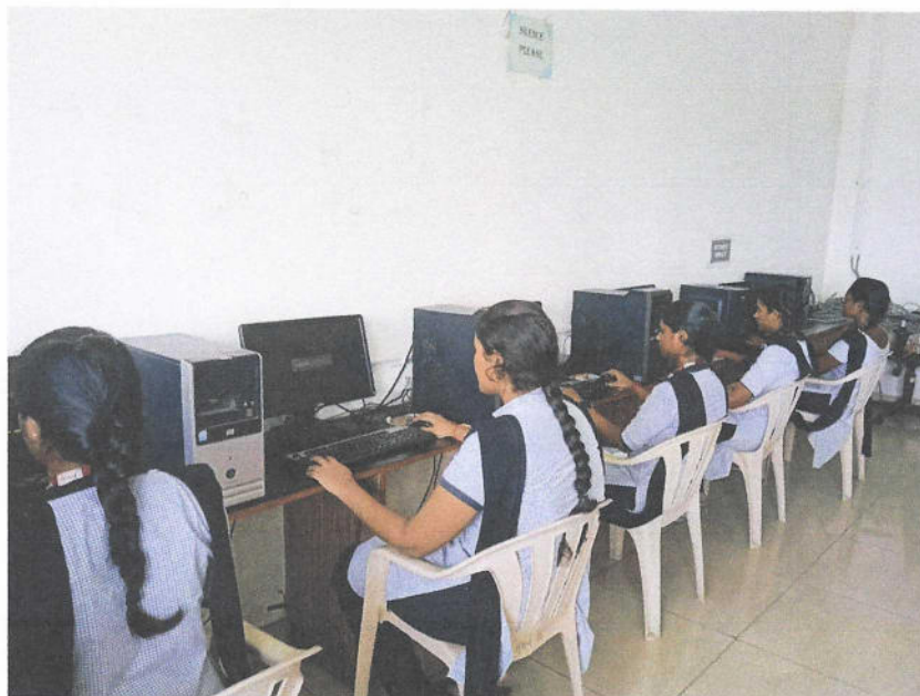
Practicing the students