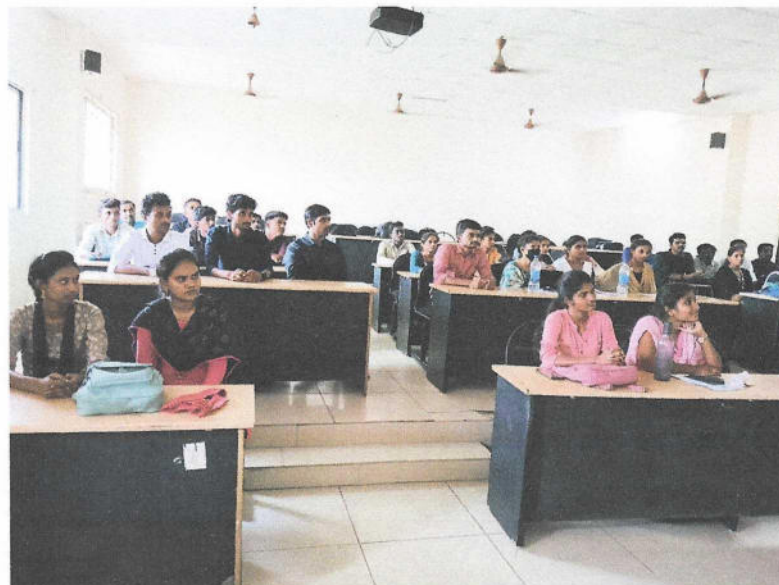
Lisioning the students

A handwritten signature in black ink, consisting of stylized, overlapping loops and lines.