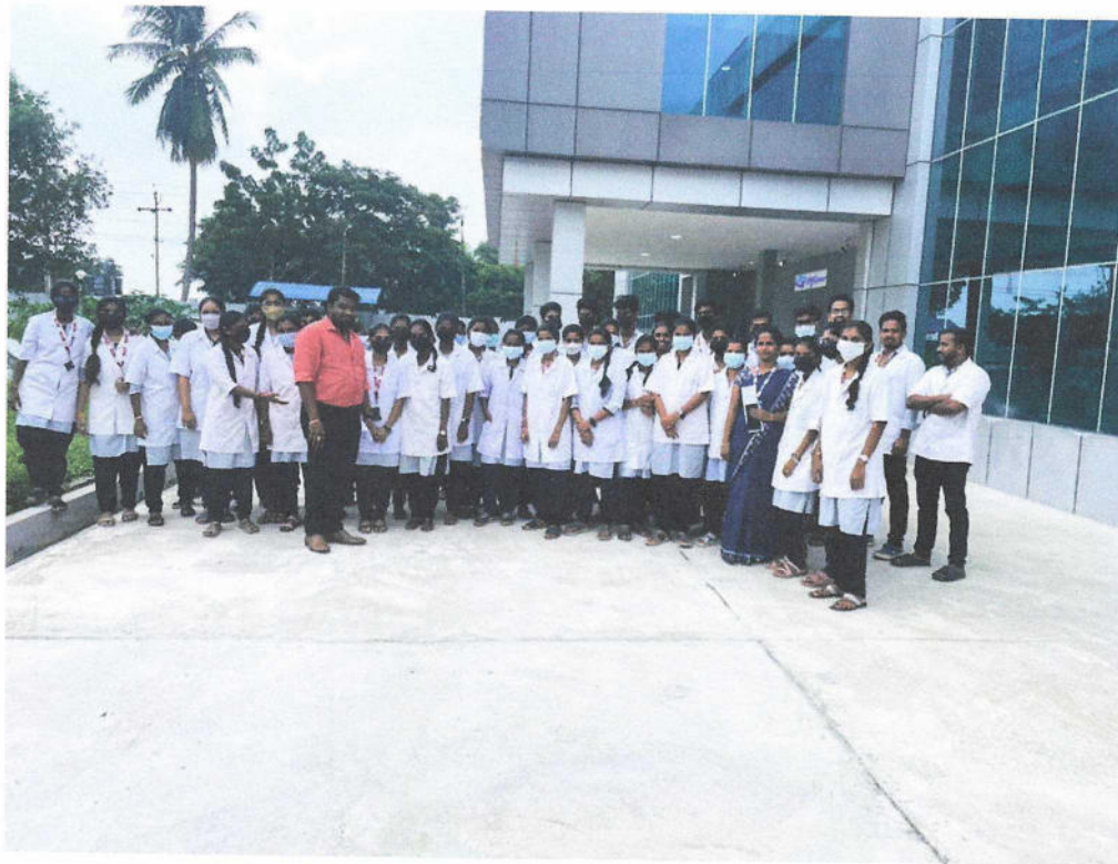
Industrial visit to pfizer health care Pvt Ltd.