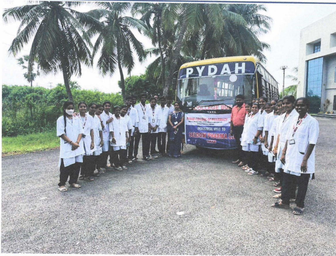
Industrial visit to Seldom Pharma Ltd.