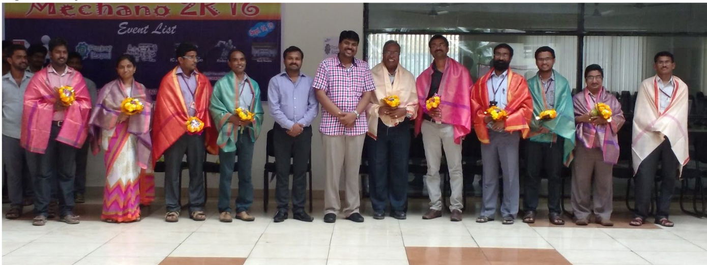
On the eve of Engineers day, Civil department student have initiated the felicitation programme to all the HOD's,vice principals and Principal.