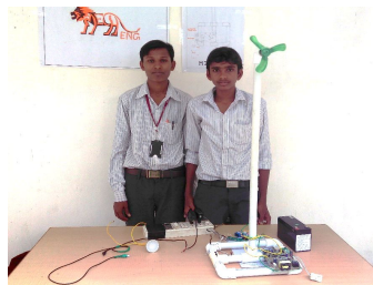
Satyanarayana mini projects